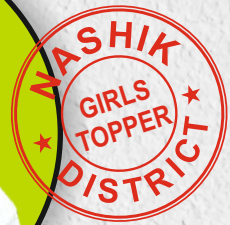
PARUL SINGH IIT-KANPUR