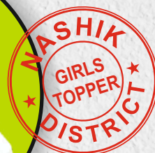
PARUL SINGH IIT-KANPUR