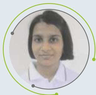
OSHIMA GOYAL AIR-380 in AIPMT AIR-126 in AIIMS 2015

Note: This Academic Calendar in all respects is applicable only at Kota. At other Resonance Study Centres, students/parents may find some 'minor' variations to accommodate City-specific features/factor. Hence, they are advised to check and go through the Academic Calendar of respective Study Centre before taking admission in any of the above Yearlong Classroom Contact Programs (YCCPs).