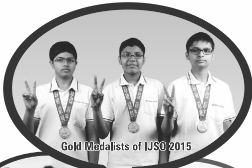
Gold Medalists of IJSO 2015

Don't predict your child's future... Create It !!!